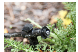
Point Source Drip

Today's drip irrigation technology has reached a state of high-level performance and is widely accepted throughout the western United States as the standard for irrigating plant material other than turf. Many cities in California, Arizona, and Nevada even require drip irrigation rather than spray in narrow landscaped areas such as park strips and parking lot islands. Two recommended types of drip irrigation are point source and inline.